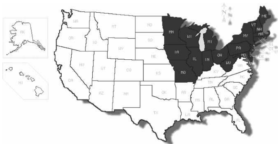
FIGURE 1. Region selected (dark area) for LCI of hardwood lumber production in the US.

The goal of this study was to document the LCI of planed dry lumber production from hardwood logs and determine the material flow, energy use, and emissions for the hardwood lumber manufacturing process on a per unit basis for the northeastern US (Fig 1). Primary data were collected through questionnaires mailed to 20 lumber mills, while secondary data were collected from peer-reviewed literature per Consortium for Research on Renewable Industrial Material (CORRIM) guidelines (CORRIM 2001). There