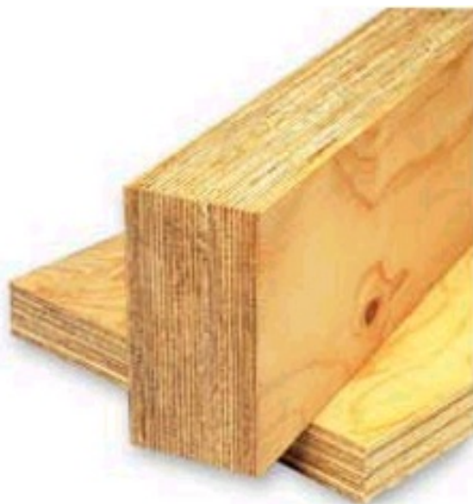
Figure 1 Laminated veneer lumber

Laminated veneer lumber is a composite wood material made from sheets of veneer generally 2.54 mm or 3.18 mm (1/10 in. or 1/8 in.) thick that are laminated together with their grain orientation in the same direction and then hot-pressed (Figure 1). LVL was first used in WWII to make airplane propellers and since the 1970s it has been used as a construction product (Neuvonen et al. 1998). LVL can vary in thickness and width but is most commonly produced in the dimensions of 4.45 cm (1 3/4-in.) thick and 121.9 cm (4 ft.) wide, into lengths from 2.44 to 18.29 m (8 to 60 ft.). It is used as an alternative to structural lumber for headers and beams and also as the flange component in wood composite I-joists. According to the APA - The Engineered Wood Association, in the year 2000 the U.S. produced 1.257 million cubic meters (44.4 million cubic feet) of LVL of which 61% was used in the manufacture of I-joists and the other 31% was used as headers or beams (APA 2001). Laminated veneer lumber can be made from any wood species provided its mechanical and physical properties are suitable and it can be properly glued. LVL in the PNW region are made with Douglas-fir ( Pseudotsuga menziesii (Mirbel) Franco). Laminated veneer lumber is used as an input into the composite I-joist (Wilson and Dancer 2005; Puettmann et al. 2012) but could also be used as a standalone for headers, beams and joists.